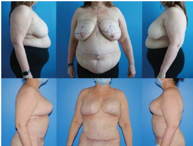
Figure 7: Before and after comparison photographs of initial presentation and final result. Pre-operative photograph of 51 year old female with left breast cancer and right breast AHD. Height 5'6" Weight 179 lbs. BMI=28.9. The patient's waist reduced in size from 48 inches to 33 inches.

educated weight reduction preoperatively and postoperatively empowers patients regarding their future breast cancer risks, body image, and overall health. New analysis from Harvard of the Pooling Project of Prospective Studies of Diet and Cancer (DCPP) demonstrates a direct relationship between the amount of weight lost and the reduction of breast cancer risk. In this study, women over fifty who sustained weight loss of greater than 20 lbs had a 26% reduction in breast cancer risk. The analysis excludes women on HRT [5]. The effects of obesity on