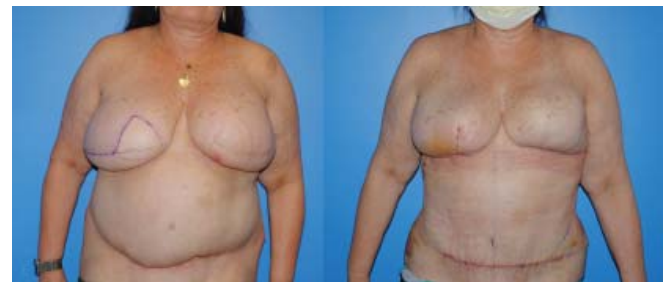
Figure 4: One year post-operatively from reduction of the bilateral reconstructed breast mounds the patient was happy with the size of the reconstruction, however the right (non-radiated) reconstructed breast had descended and the left reconstructed breast mound stayed in the elevated position. The patient chose to proceed with right breast mastopexy and additional reduction of the right breast mound.

to match the pre-operative breast size. The largest silicone implant available is 800 cc while some mastectomy specimens in patients with high BMI exceed 1000 grams. Autologous flap reconstruction also gives patients with a higher BMIs the ability to change their overall body shape and lose weight. We commonly encounter many patients who have been given a new diagnosis of breast cancer and state, “I did everything right my whole life... I don’t smoke, I don’t drink alcohol, etc.” and often a feeling of powerlessness or “unluckiness” ensues. We have found in a subset of patients with a high BMI that safe and