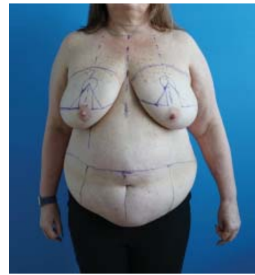
Figure 2: Preoperative markings for either (1) lumpectomy and oncoplastic reconstruction or (2) nipple removing bilateral mastectomy and autologous flap reconstruction.

We have encountered many patients in our practices who have a high body mass index and who choose to undergo autologous flap reconstruction. Our experience is similar to that encountered nationally where patients with a high body mass index have a high satisfaction rate with autologous flap reconstruction [3-5]. This may be accounted for by the ability