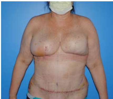
Figure 6: Timeline of weight loss after initiation of high protein diet and autologous flap reconstruction. The final body mass index of the patient was below.