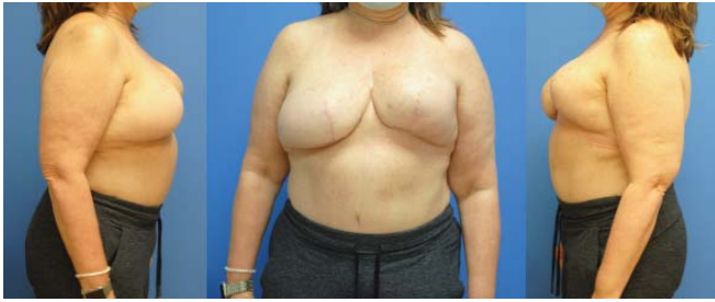
Figure 5: One week post-operatively from right breast mastopexy reduction and final abdominal donor site scar revision. The right inframammary fold was elevated and the flap was debulked superior to the inframammary fold to allow contraction of the fold. Raising an inframammary fold is challenging when the breast mound is heavy and or the abdominal girth is heavy as the fold tends to drop. Radiation has the effect of elevating the inframammary fold.